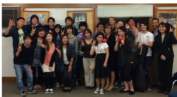
Tohoku project participants Photo courtesy Ginger Sera