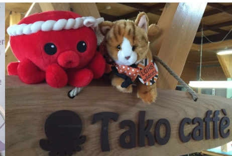
Japanese & U.S. Tohoku project mascots together at Tako Caffè