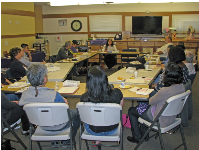
Teachers Workshop—Jeanne Watsuki Houston presenting

One teacher's evaluation included a comment by the late George Carlin, who had remarked on the Constitution and the "rights" of citizens of the United States, calling them "privileges." He had said in one of his last performances, "Rights aren't rights if they can be taken away. If you're not sure, look up Japanese Americans 1942." It was truly a priceless day for Region 5 educators.