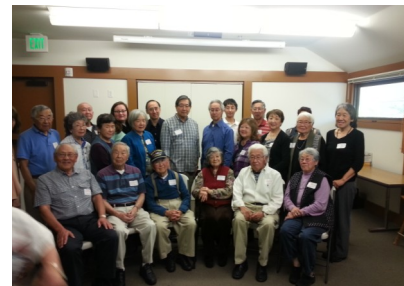
Jerome-Rohwer interview participants & helpers