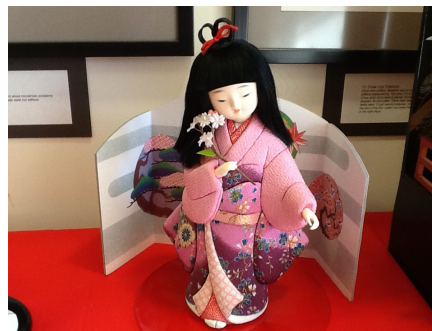
Hinamatsuri doll by Flo Altona