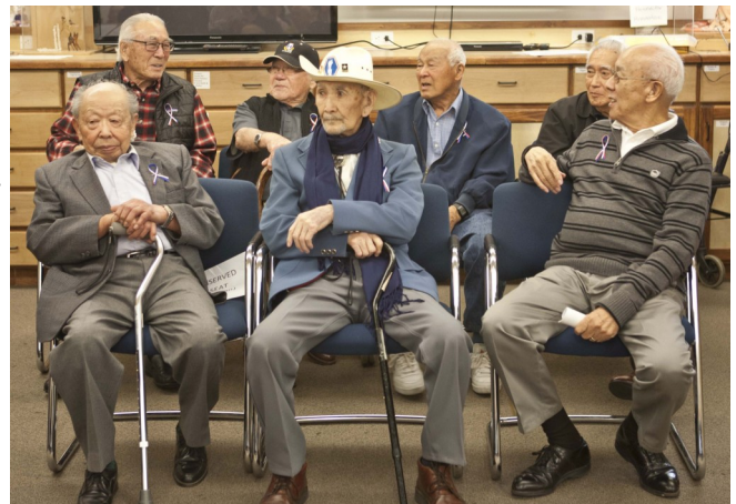
Bay Area WWII & Korea vets